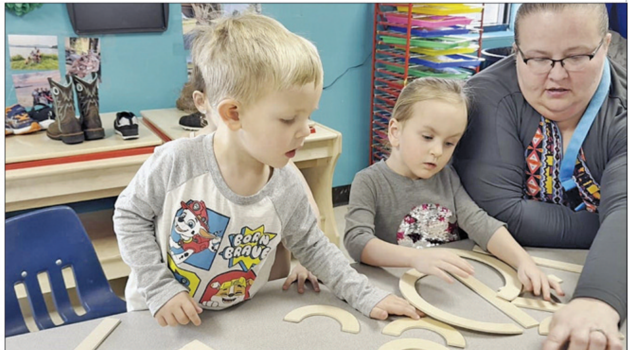
YOUNG LEARNERS — Preschool students at the YMCA of Rapid City, S.D., use pieces of wood to create letters of the alphabet.