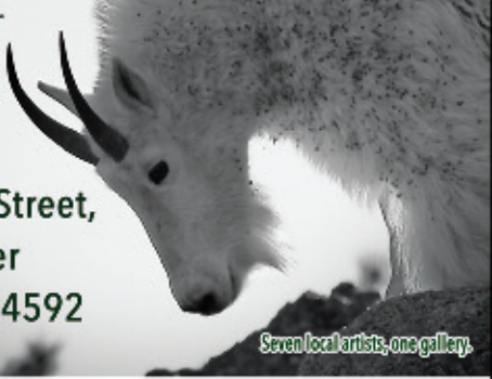
Seven local artists, one gallery.

A GALLERY OF GIFTS AWAITS! Open All Year!